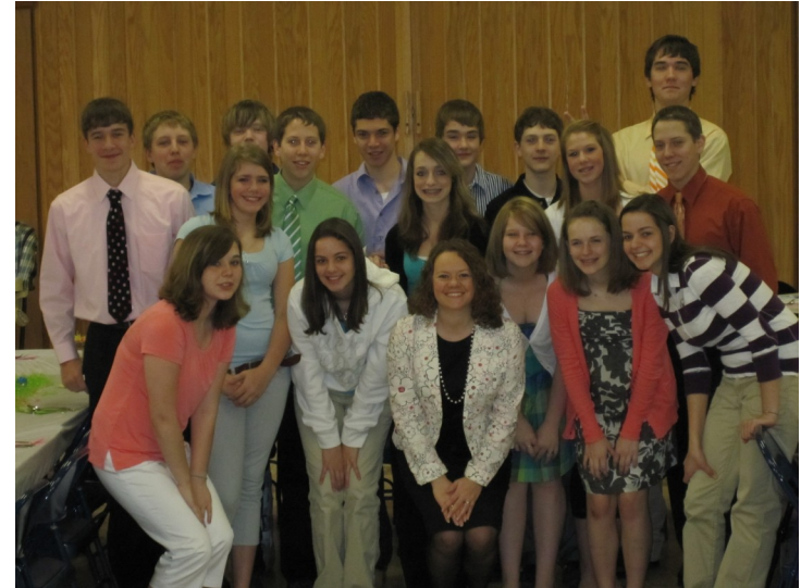
Youth before the Early Service on Easter Sunday... some were VERY nervous! Don't they clean up nicely??