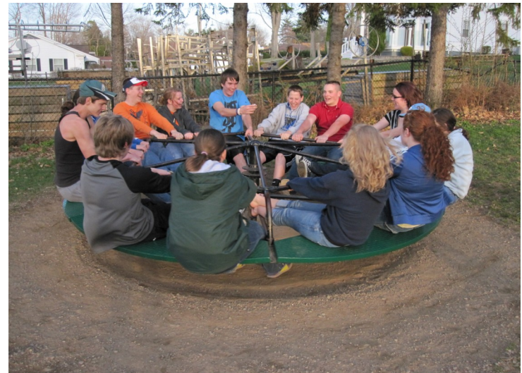
Youth on the merry-go-round at Lakewood Beach after ice cream at DQ and devotions by the playground!